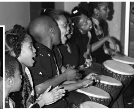
Paul's Place Children drumming up a storm!