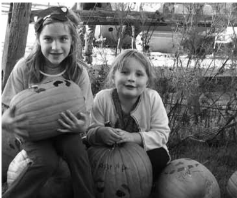
Children had a blast painting pumpkins, jumping in the moon bounce, trying their hand at the bean bag toss, and riding ponies from the Greenspring Valley Pony Club.